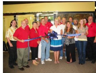
Moule's Elk Grove Glass 9744-A Dino Drive (916) 685-3909