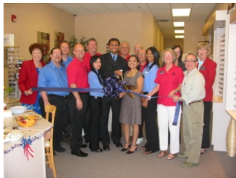
Axis Optometric Group 7119 Elk Grove Blvd. #123 (916) 478-2778