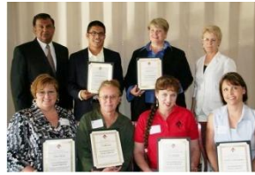
2009 Graduating Class

Applications for Chamber's 2009-2010 Leadership Elk Grove class due September 15 th