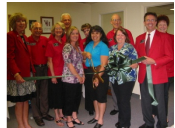
VanDoren/Minard Insurance 7493-A Reese Road, Sacramento (916) 681-5554