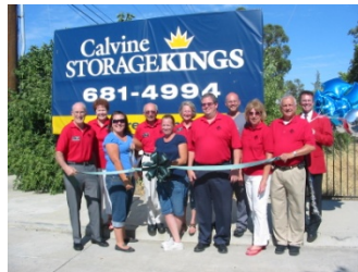
Calvine StorageKings 8740 Calvine Road, Sacramento (916) 681-4994