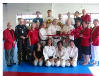
School of the Tiger 2301 Longport Court (916) 690-5321