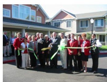
The Commons at Elk Grove 9564 Sabrina Lane (916) 683-6833