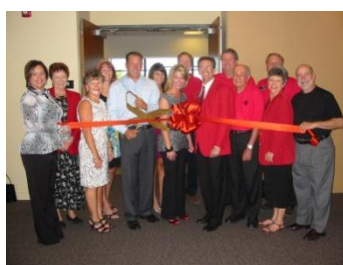
Mason Bay Media 9245 Laguna Springs Dr. #200 (916) 801-8487