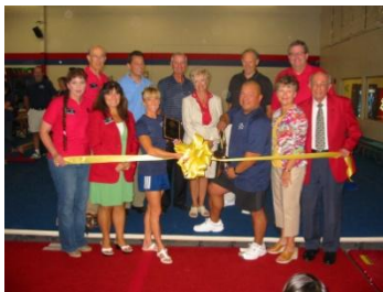
Byers Gymnastics Center 3132 Dwight Road, #100 (916) 393-3993