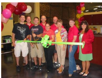
California Family Fitness 3443 Laguna Boulevard (916) 233-1300