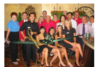
Villa Vista Dental 2471 Elk Grove Boulevard (916) 691-6800