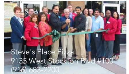
Steve's Place Pizza 9135 West Stockton Blvd #100 (916) 683-2200