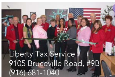
Liberty Tax Service 9105 Bruceville Road, #9B (916) 681-1040