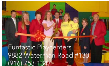
Funtastic Playcenters 9882 Waterman Road #130 (916) 753-1347