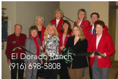
El Dorado Ranch (916) 698-5808