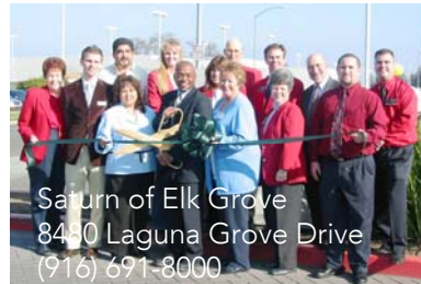
Saturn of Elk Grove 8480 Laguna Grove Drive (916) 691-8000