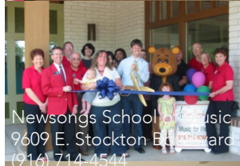
Newsongs School of Music 9609 E. Stockton Boulevard (916) 714-4544