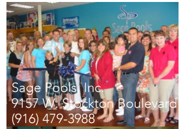
Sage Pools Inc 9157 W. Stockton Boulevard (916) 479-3988