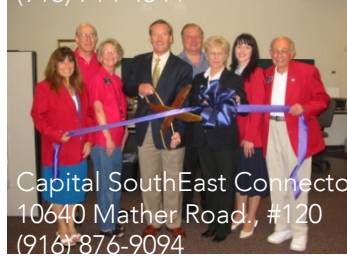
Capital SouthEast Connector -JPA 10640 Mather Road, #120 (916) 876-9094