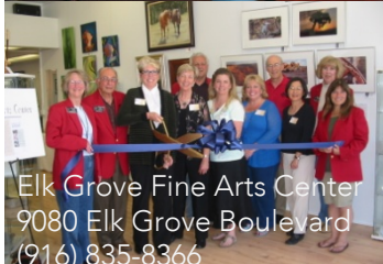
Elk Grove Fine Arts Center 9080 Elk Grove Boulevard (916) 835-8366