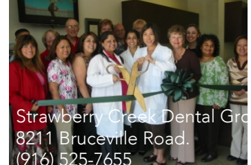
Strawberry Creek Dental Group 8211 Bruceville Road. (916) 525-7655