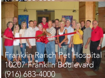
Franklin Ranch Pet Hospital & Hotel 10207 Franklin Boulevard (916) 683-4000