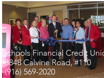
Schools Financial Credit Union 3848 Calvine Road, #110 (916) 569-2020