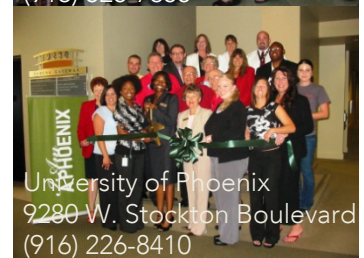
University of Phoenix 9280 W. Stockton Boulevard (916) 226-8410